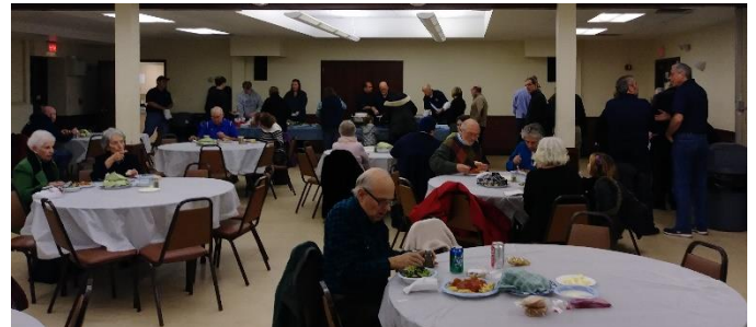
St. John Vianney Council Pasta Dinner